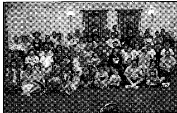
Merrill's Marauders, "Second Generation" Group Picture at Columbus, GA. 2003 Reunion