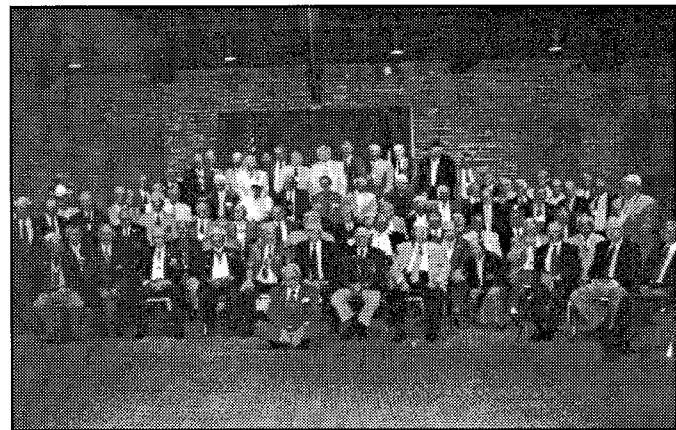
Merrill's Marauders Men present at Columbus, GA. 2003 Reunion