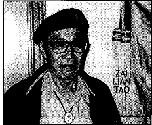
Chinese War Vet Burma 1944 at M.M. Reunion 2001